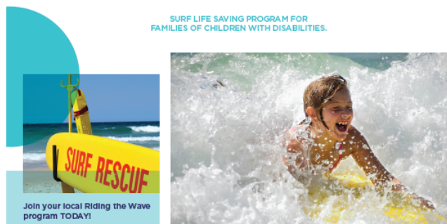
Join your local Riding the Wave program TODAY!

SURF LIFE SAVING PROGRAM FOR FAMILIES OF CHILDREN WITH DISABILITIES.